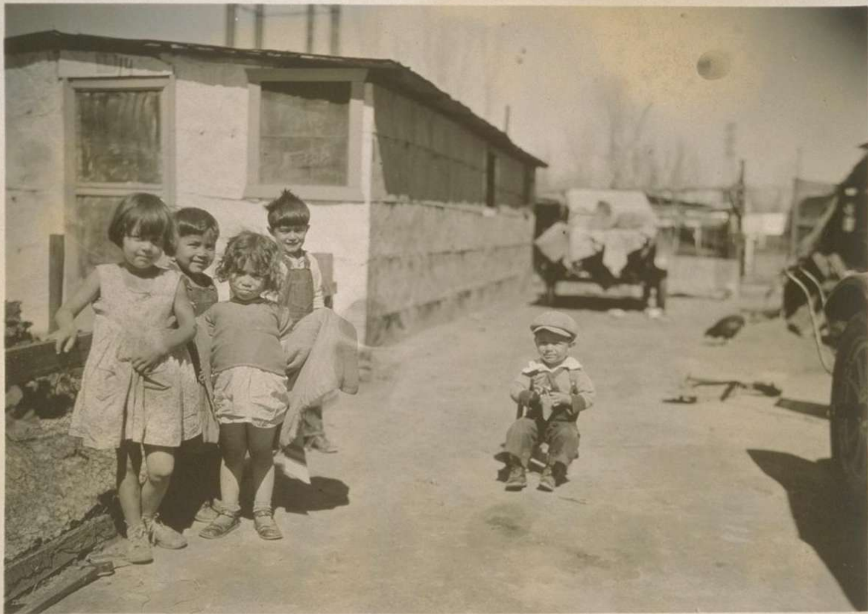
Hooverville, Sacramento, Calif. Some of Hoovervilles younger citizens.