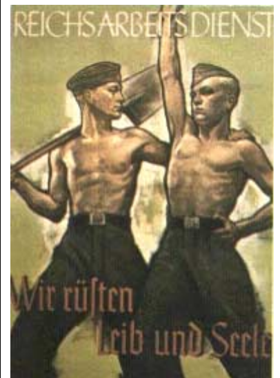
Nazi Propaganda poster for the Reichsarbeitsdienst (National Labour Service)